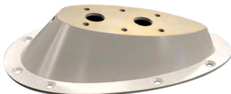
Antenna Contour Plate