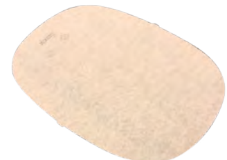
Window Dust Pane