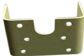
Universal AC Outlet Bracket